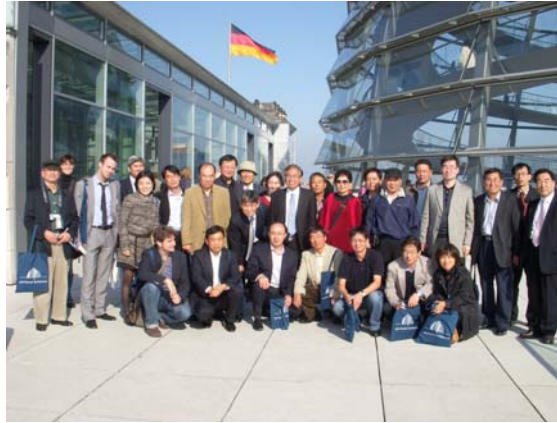
Photo of the TSB-ADeKo Berlin-Seminar in Berlin in October 2008